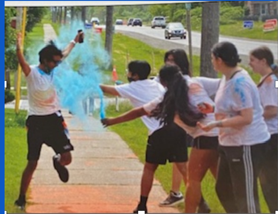
The Colour Run