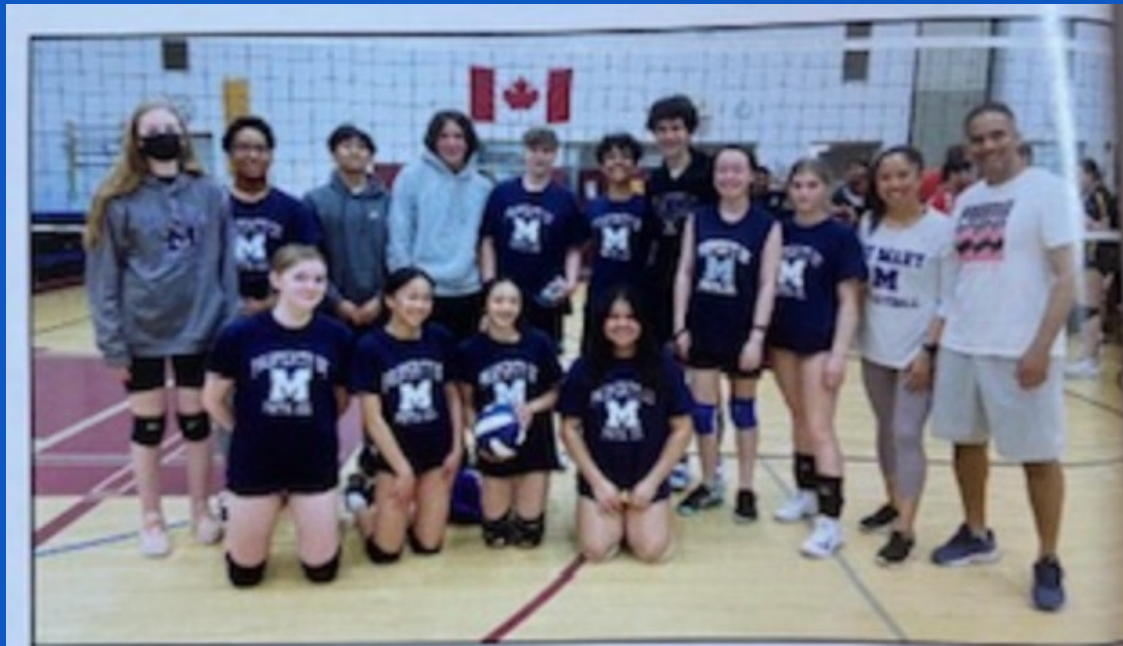
Girls Volleyball Team